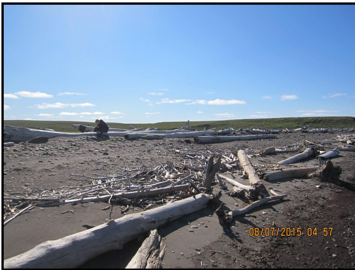
Figure 1- Photo taken by William Hurst.

Prepared by: Bessie Rogers, Western Arctic Research Centre