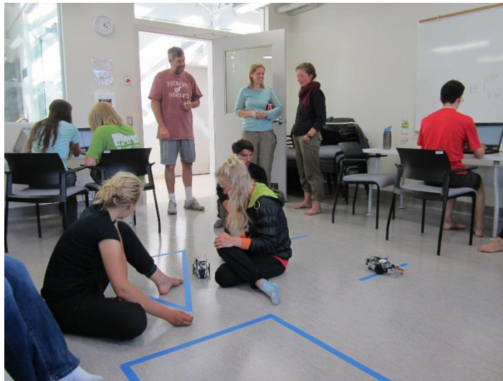
Figure 4- Robotics Demonstration