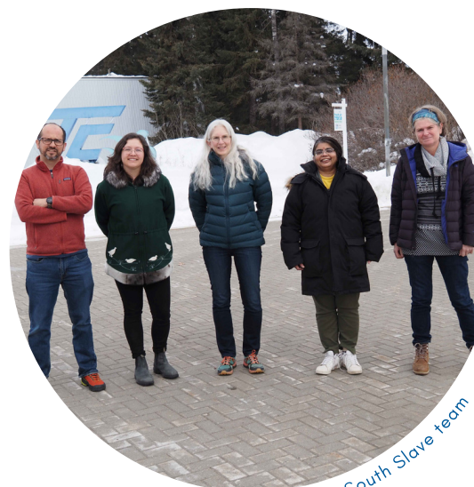
Most of the ARI- South Slave team

Now that many of the COVID-19 public health restrictions are being lifted, we look forward to welcoming you back to our office (Room 139 at Thebacha Campus) to talk about research ideas and needs - or just to say hi! You can also give us a call at 872-7080. We are busy making plans for the summer and coming up with ideas for growing and sharing research in the community, so be sure to stay in touch!