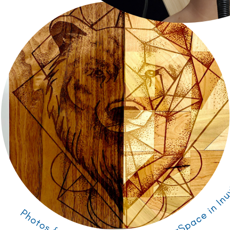
Photos from the INNOVATE MakerSpace in Inuvik