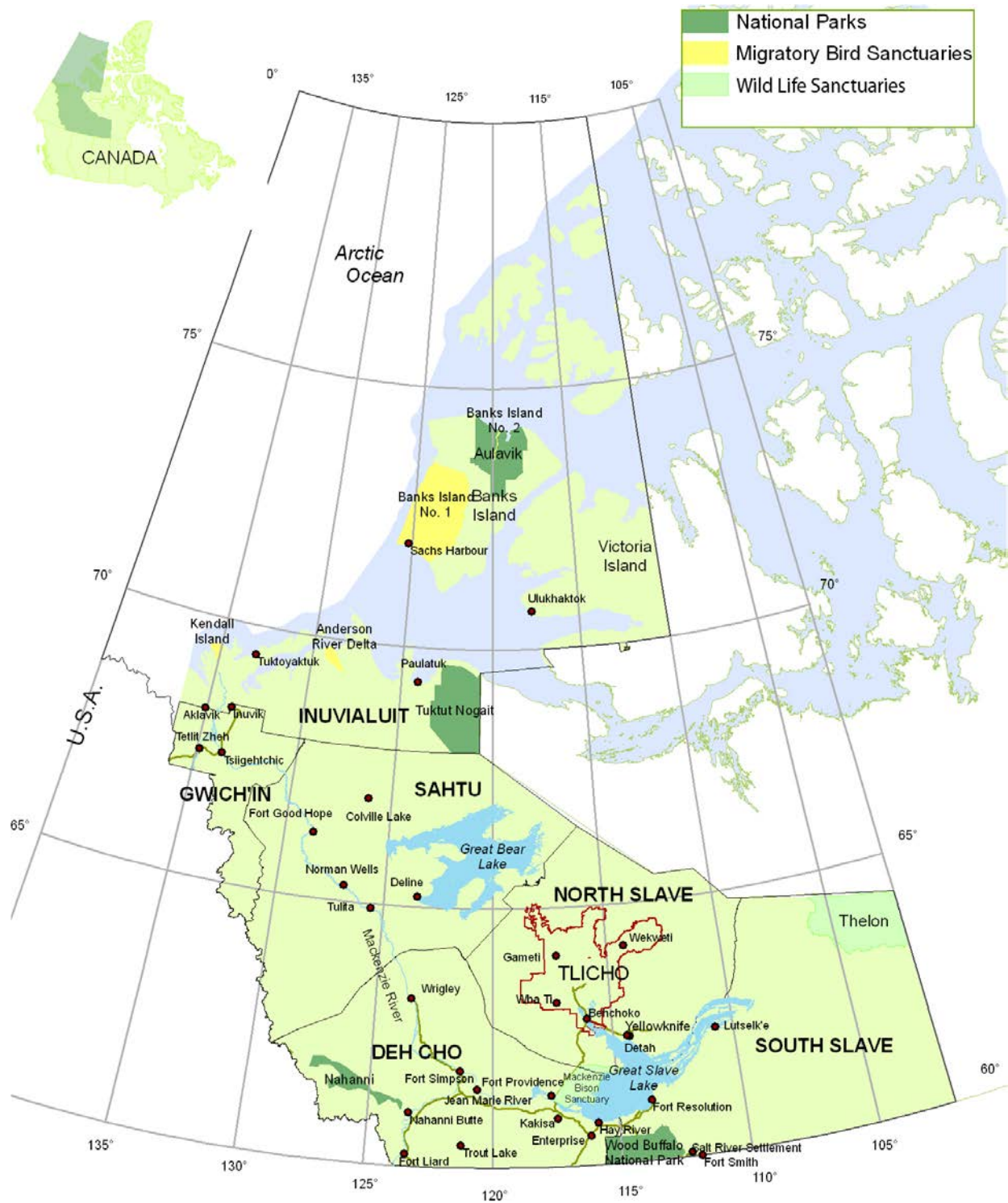
Figure 1: Land Claim Regions in the Northwest Territories (Aurora Research Institute)