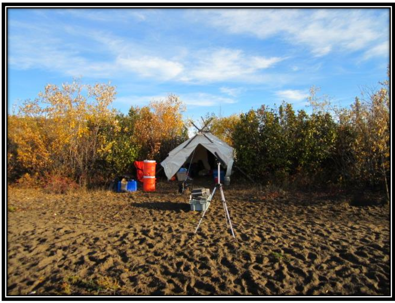
Tent frame at Campbell Lake, ENRTP fall camping trip.

Prepared by: Bessie Rogers, Western Arctic Research Centre