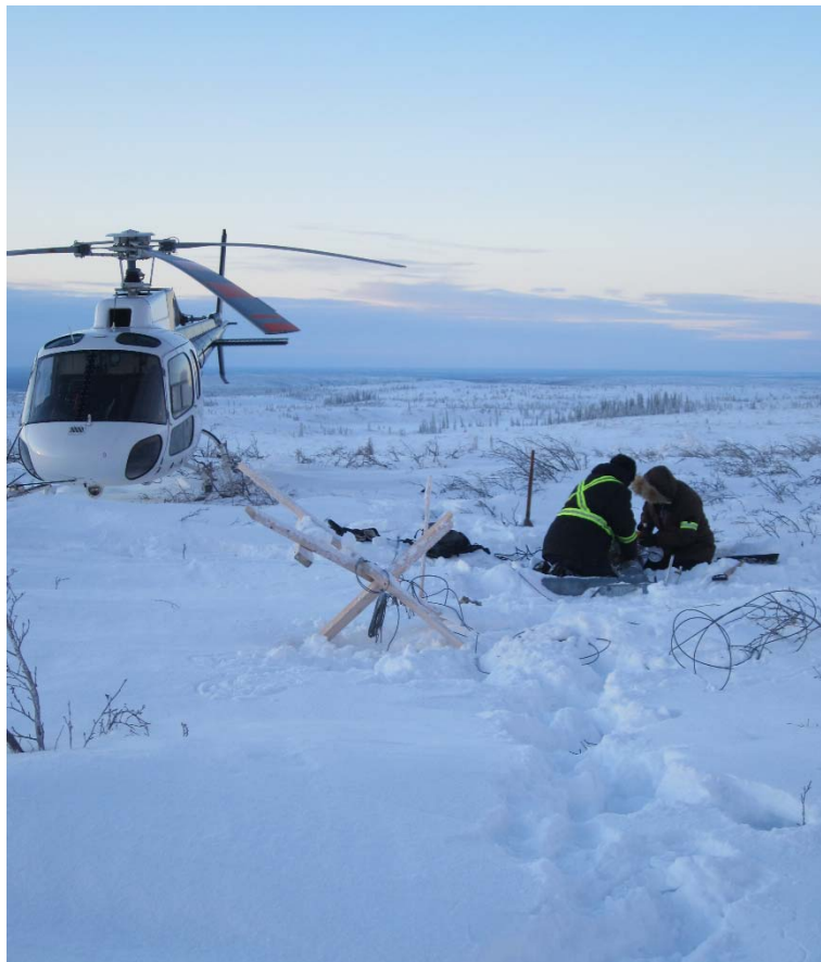
Field work at the Inuvik High Point wind monitoring site.

Prepared by: Bessie Rogers, Western Arctic Research Centre